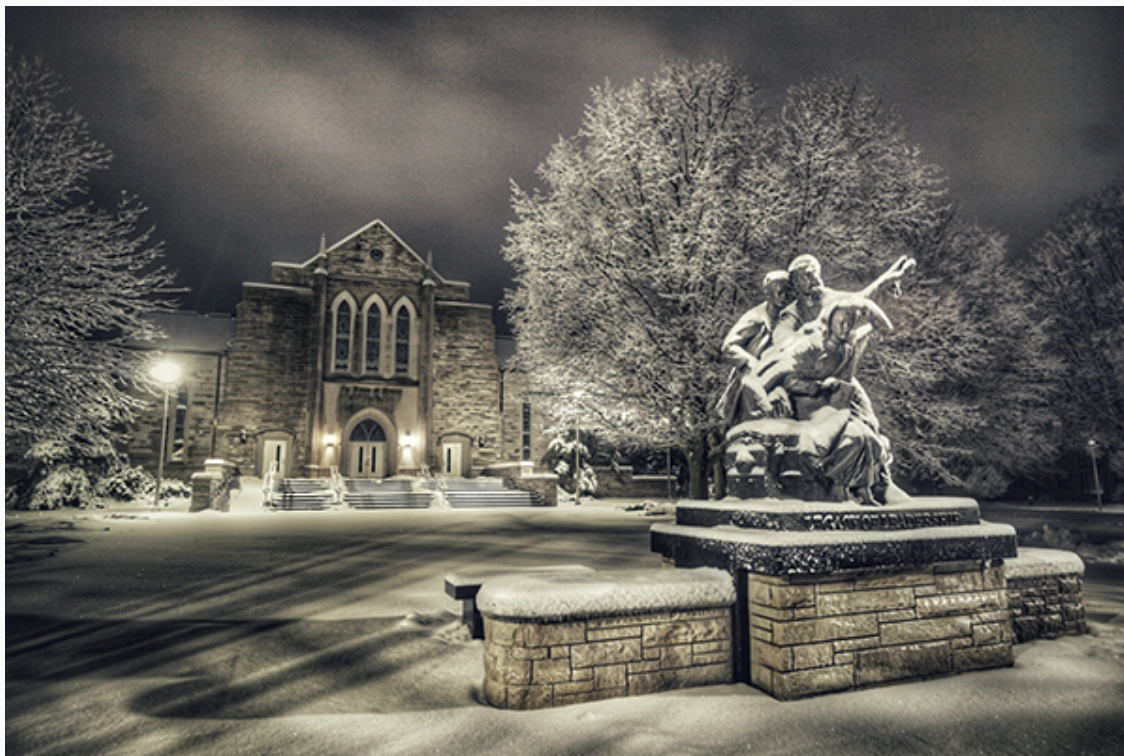
The J.N. Andrews statue on the campus of Andrews University coated in ice and snow during the pre-dawn hours.

Thanks for reading the Lake Union Herald newsletter. Tell your friends to follow along by signing up here .