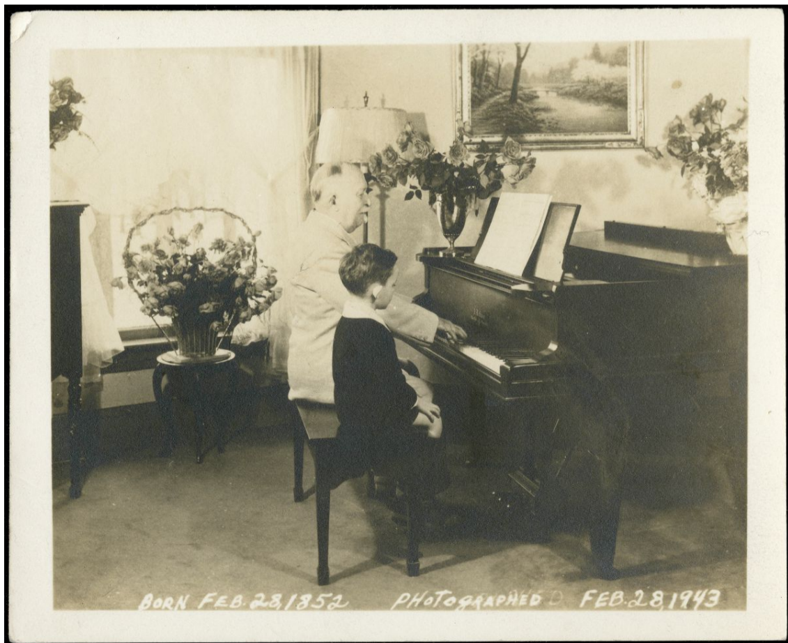
Famed health proponent John Harvey Kellogg was born on February 26, 1852. This photograph shows Kellogg on his 91st birthday, playing the piano for a child. Kellogg is best known for directing the Battle Creek Sanitarium and inventing flaked breakfast cereal. He was also an author, doctor, nutritionist, and a friend to James and Ellen White. Although he later left the church, Kellogg played a major role in the early