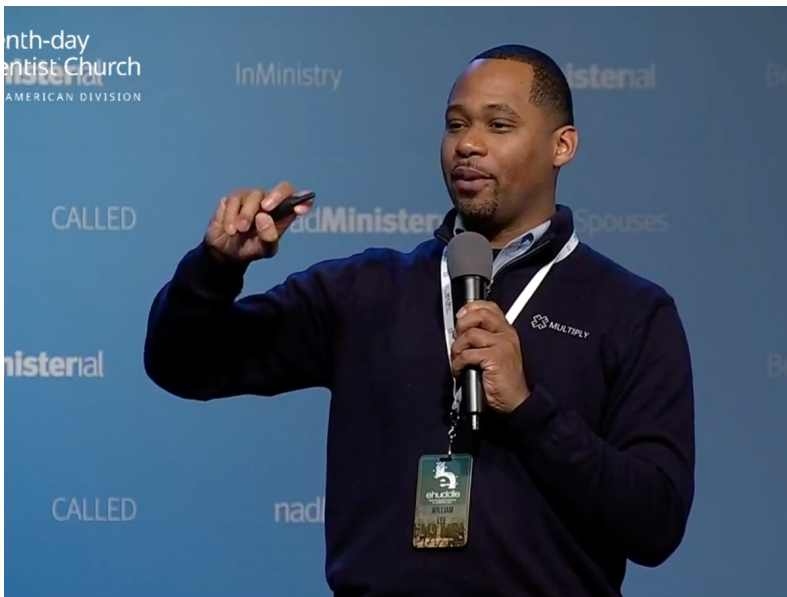
A group of pastors, division, union, conference and church leaders met in