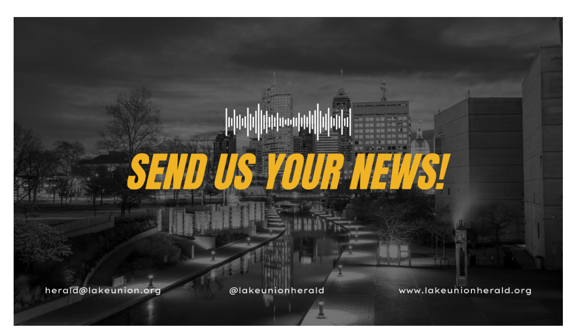
Thanks for reading the Lake Union newsletter. Please share it widely.

We can't deliver news from your spam folder. Be sure to add herald@lakeunion.org to your contacts. In Gmail, drag this newsletter over to your 'Primary' tab. And, of course, you can read us with any tips, ideas, critiques by replying to this email.