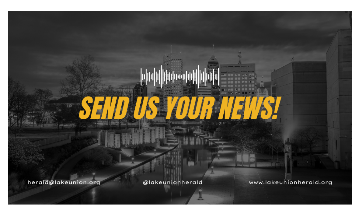
Thanks for reading the Lake Union newsletter. <u>Please share</u> it widely.

We can't deliver news from your spam folder. Be sure to add herald@lakeunion.org to your contacts. In Gmail, drag this newsletter over to your 'Primary' tab. And, of course, you can read us with any tips, ideas, critiques by replying to this email.