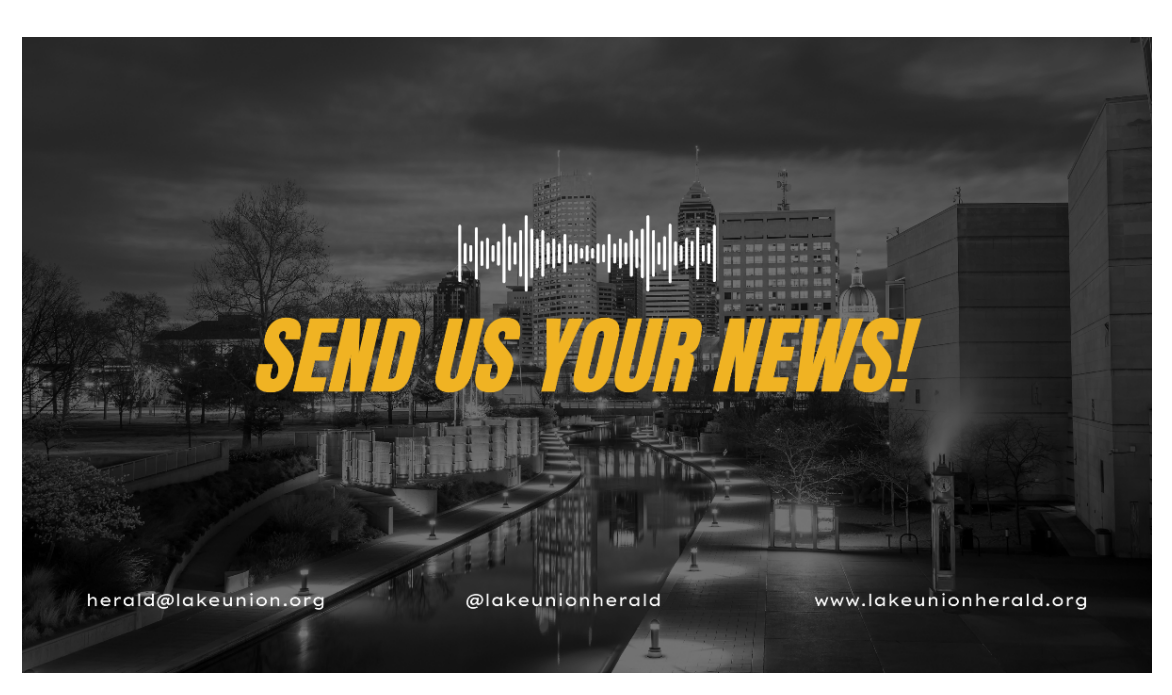
Thanks for reading the Lake Union newsletter. <u>Please share</u> it widely.

We can't deliver news from your spam folder. Be sure to add herald@lakeunion.org to your contacts. In Gmail, drag this newsletter over to your 'Primary' tab. And, of course, you can read us with any tips, ideas, critiques by replying to this email.