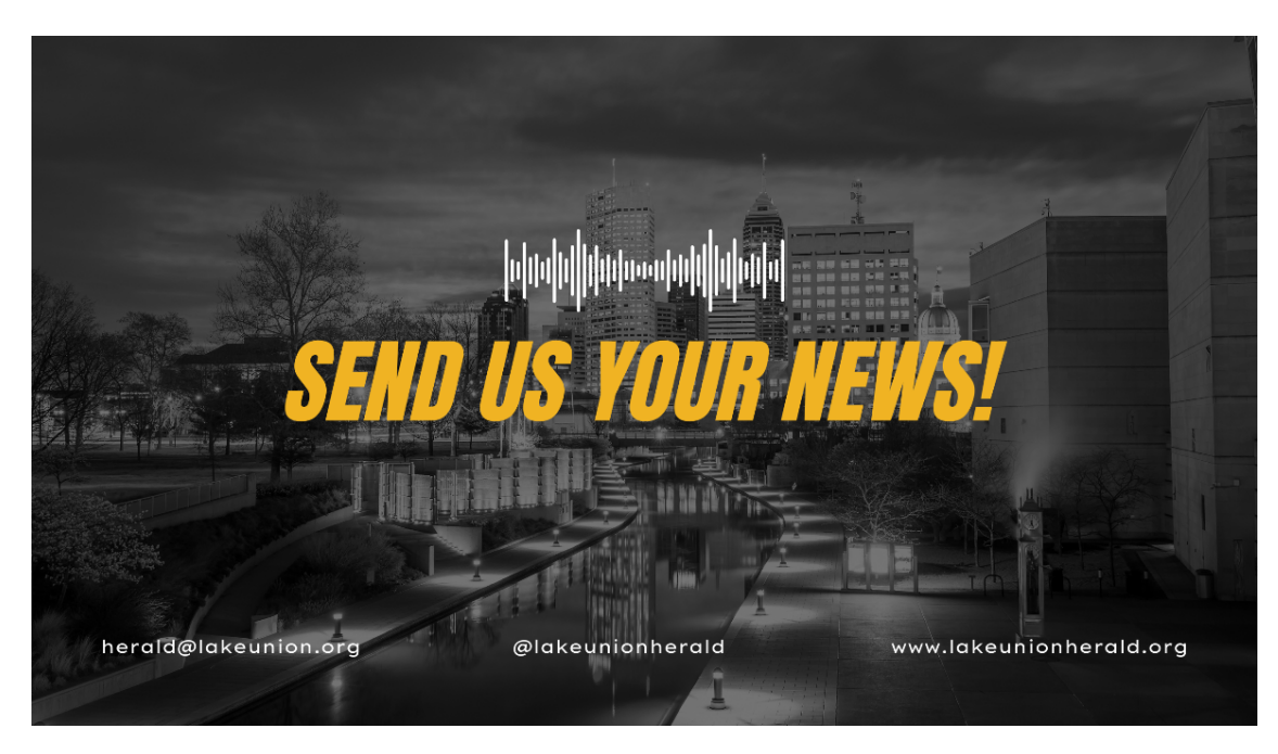
Thanks for reading the Lake Union newsletter. <u>Please share</u> it widely.

We can't deliver news from your spam folder. Be sure to add herald@lakeunion.org to your contacts. In Gmail, drag this newsletter over to your 'Primary' tab. And, of course, you can read us with any tips, ideas,