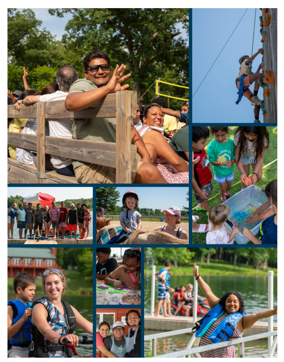
We had a blast hanging out at the Illinois Family Camp Meeting at Camp Akita! Enjoy and browse through the photos from the weekend.