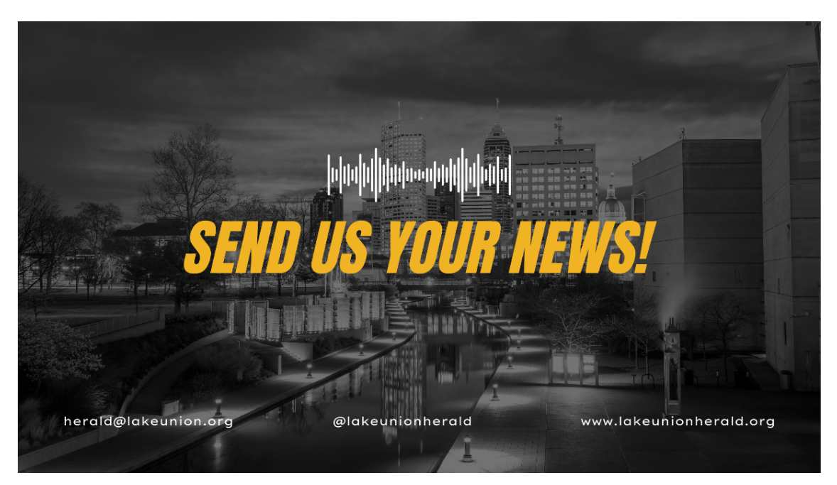
Thanks for reading the Lake Union newsletter. <u>Please share</u> it widely.

We can't deliver news from your spam folder. Be sure to add herald@lakeunion.org to your contacts. In Gmail, drag this newsletter over to your 'Primary' tab. And, of course, you can read us with any tips, ideas, critiques by replying to this email.