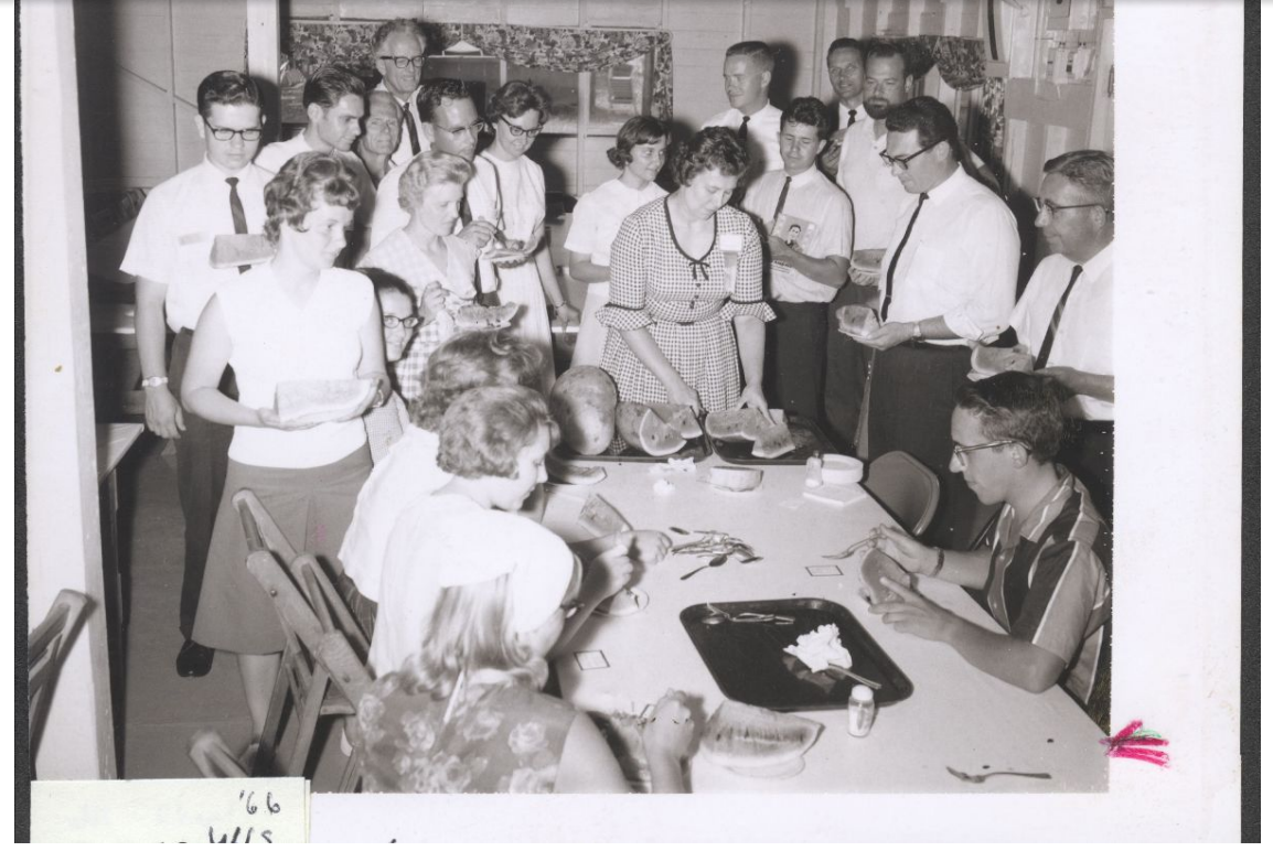
One of the best parts of summer in the Lake Union is the bounty of fresh and delicious fruit and vegetables. In 1966, the Wisconsin Chapter of the Andrews University Alumni Association gathered to enjoy a watermelon feed. There's nothing like sharing memories of school days over a cool slice of fresh Wisconsin watermelon, and it was a good way to beat the heat.