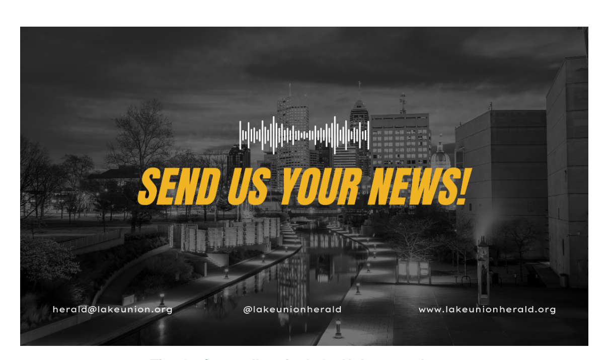
Thanks for reading the Lake Union newsletter. <u>Please share</u> it widely.

We can't deliver news from your spam folder. Be sure to add herald@lakeunion.org to your contacts. In Gmail, drag this newsletter over to your 'Primary' tab. And, of course, you can read us with any tips, ideas, critiques by replying to this email.