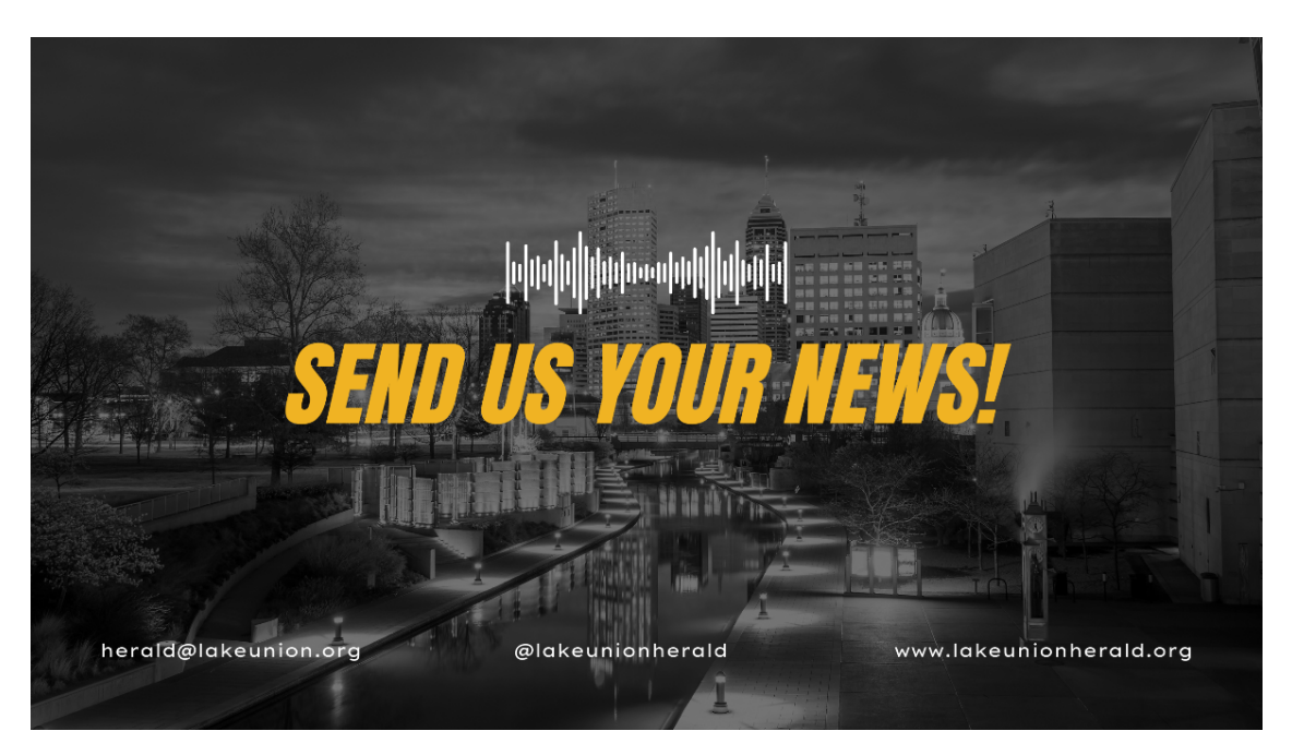
Thanks for reading the Lake Union newsletter. <u>Please share</u> it widely.