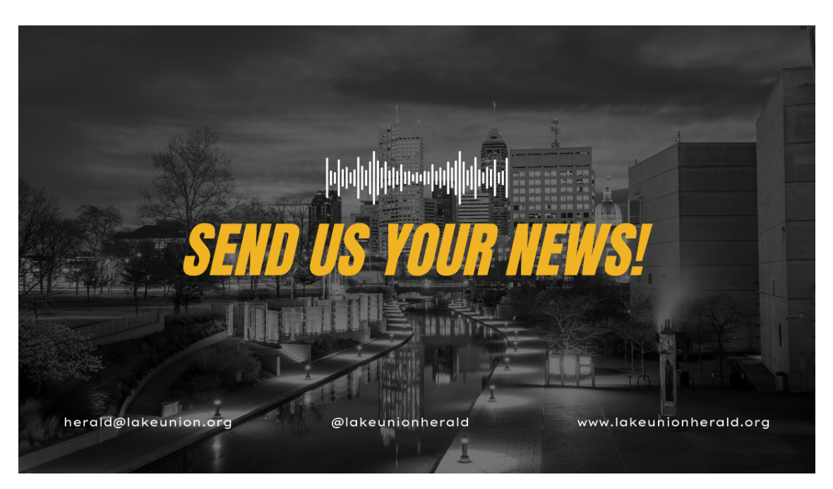
Thanks for reading the Lake Union newsletter. <u>Please share</u> it widely.

We can't deliver news from your spam folder. Be sure to add herald@lakeunion.org to your contacts. In Gmail, drag this newsletter over to your 'Primary' tab. And, of course, you can reach us with any tips, ideas, critiques by replying to this email.